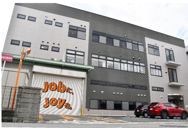
Full view of the facility

Harima has been long involved in the employment of individuals with disabilities and will continue these initiatives in order to actively promote the creation of a more diverse and inclusive society.